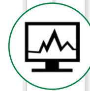
Tools & Resources

We use our role and influence in a relatively traditional industry to ask tough questions, push the status quo, and share unique solutions to drive change.