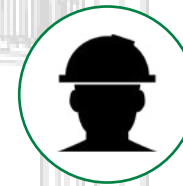
Job Site Practices